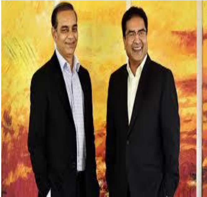
MOTILAL OSWAL & RAAMDEO AGARWAL