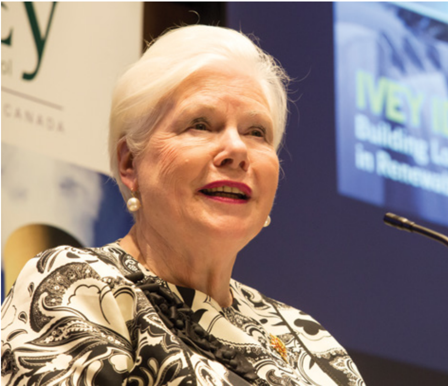
Her Honour Elizabeth Dowdeswell, Lieutenant Governor of Ontario